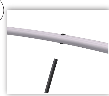
8.Then the other end in the top ring