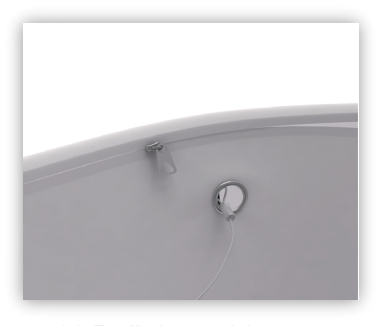
11.Pull the cable up through the eyelet to make it ready for the lift.