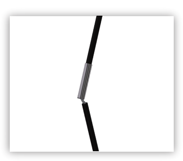
Now using some force connect the sections together.