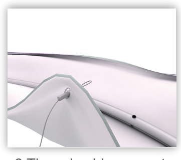
6.Thread cable support through eyelet.