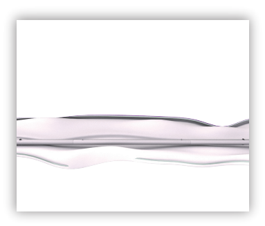
Put the frame on top of the fabric print.