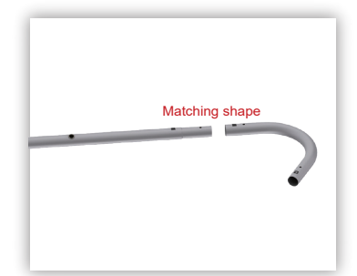
Frame ends have a code shape that needs to match.