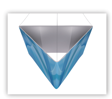
12. Connect all cables to a single hook and you're ready to hang it.