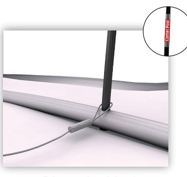
7. Place the black vertical shafts in the bottom ring.