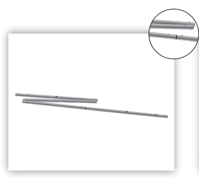
1. Start connecting the different sections of the frame by pushing the ends together.