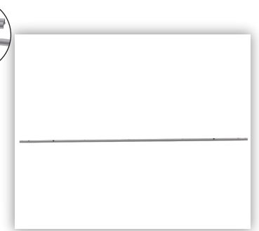
2. There are 3 lengths that you need to pre assemble.